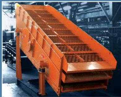
2.5 Deck BIVITEC® HD