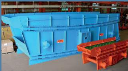
*2400x9 and 1000x3 shown