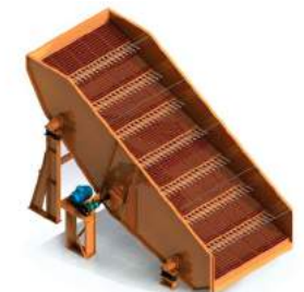
KRS/ED 3000 x 8m • 3D deck to resist difficult materials • Fingers and cascade design to turn material/ designed for MSW