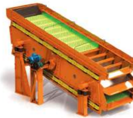
KRLL/DD (2.5) 1900 x 6m • Double Deck 6' x 20' • Two cuts on top deck with conveying deck underneath • Wider Panels