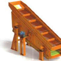
KRL/ED HD 1600 x 6m • Fixed metal deck designed for recycled materials plus metals • BIVITEC bottom deck for fines separation