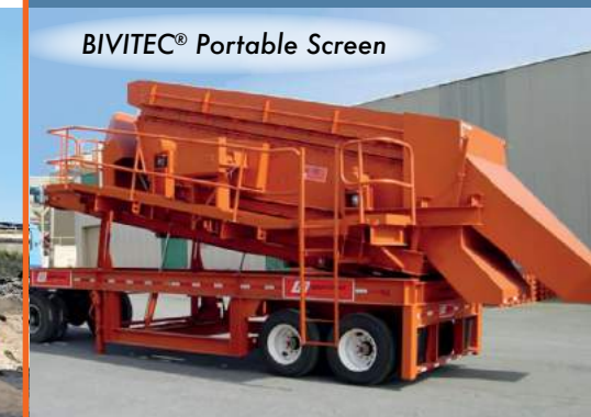
BIVITEC® Portable Screen