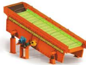
KRL/ED 1600 x 5m • Single Deck 5' x 16'