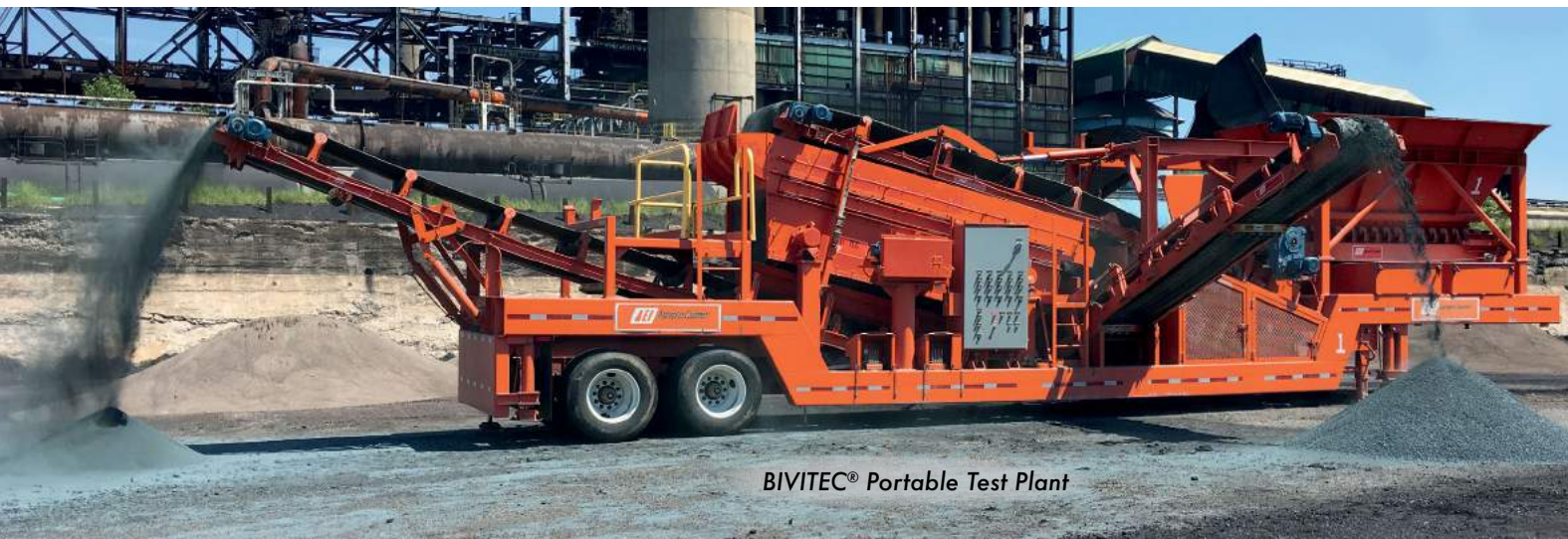
BIVITEC® Portable Test Plant