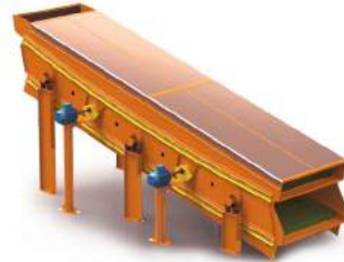
KRL/DD 'B' 3000 x 12m • Double Deck 10' x 40' • Banana (B) design for more capacity and efficiency