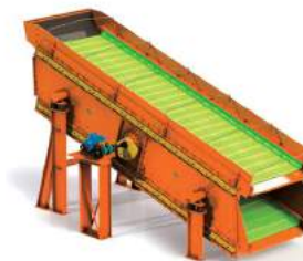
KRL/DD 2400 x 8m • Double Deck 8' x 27'