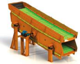
KRL/DD 'B' 1900 x 7m • Double Deck 6' x 23' • Banana (B) design for more capacity and efficiency