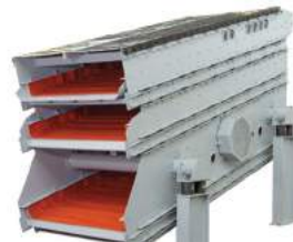
3 Deck BIVITEC®