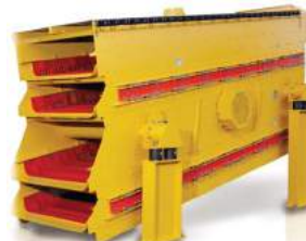
4 Deck BIVITEC®