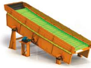
KRL/ED 'B' 1900 x 9m • Single Deck 6' x 30' • Banana (B) design for more capacity and efficiency