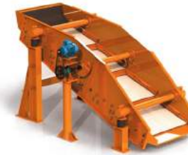
KRS/ED 1600 x 6m • Conventional screen • Stepped deck to turn material