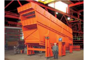
KRL/DDS HD 2400 x 7m • 'SP' decks at different angles • HD conventional scalping deck