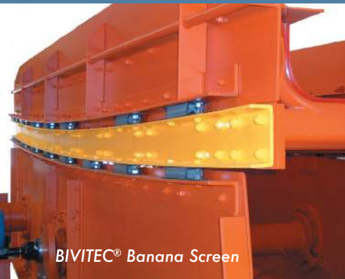
BIVITEC® Banana Screen

Applications once judged impossible can now be accomplished with the BIVITEC® screen.